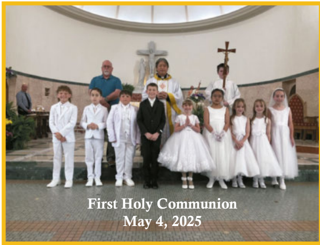
First Holy Communion May 4, 2025

Please keep these children in your thoughts and prayers as they continue to grow closer to our Lord this Easter Season and throughout their lives.