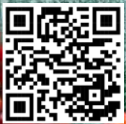
GIVING QR Code

Saint Sebastian Parish Annual Report 2024